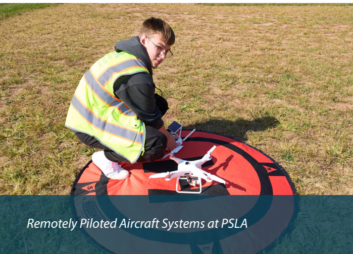
Remotely Piloted Aircraft Systems at PSLA

The P-TECH program is designed to motivate and enable students to earn a college degree and successfully transition into the workplace, with the preparation and skills needed by employers.