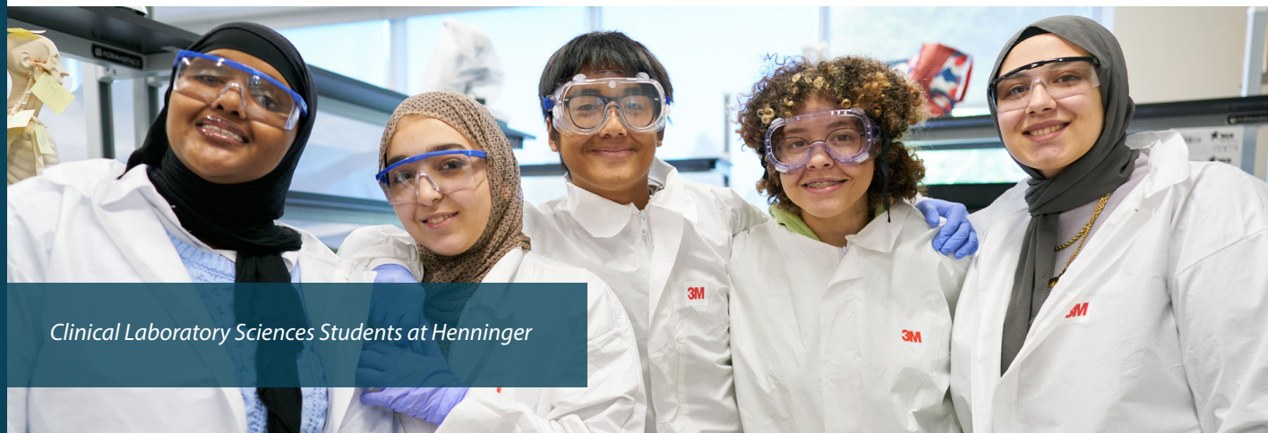
Clinical Laboratory Sciences Students at Henninger

See who SCSD is partnering by scanning the QR code. Select "More Information" for each program to see all the partners involved with that particular program.