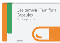
Prescription flu medicine